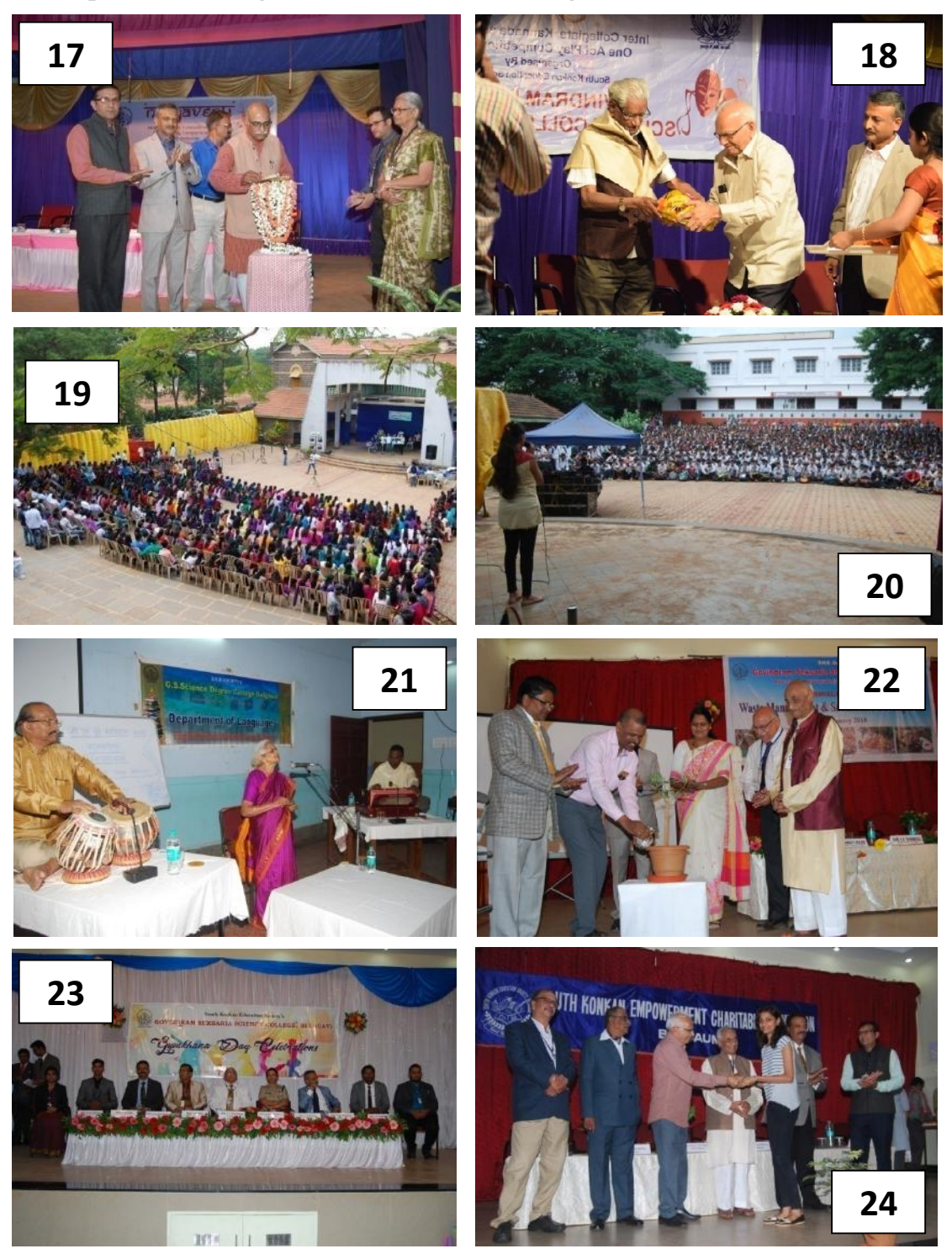
17 & 18) Inauguration and Valedictory of "Natyavenu"; 19 & 20) "Barsaat" & Annual Social Gathering Cultural Events. 21) Kirtan Parampara; 22) Inauguration of National Seminar on Solid Waste Management; 23) Annual Day Prize Distribution; & 24) SKE Charitable Foundation Scholarship distribution.