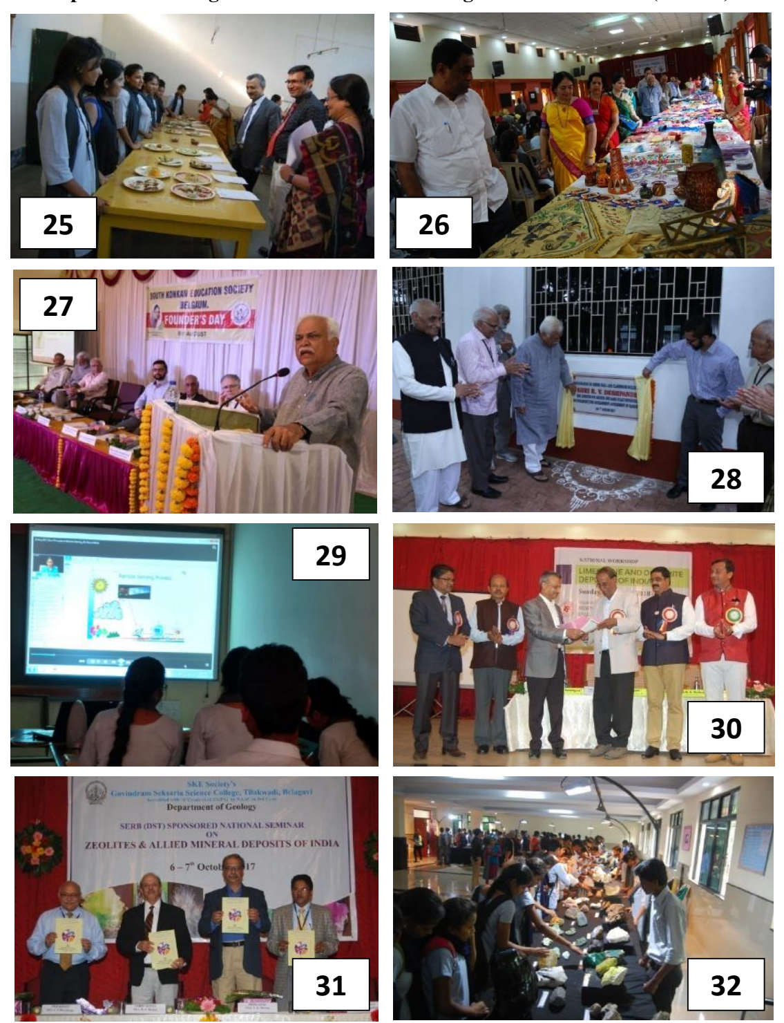
25) Cooking Competition by Ladies Association; 26) Exhibition by Hobby Centre "Earn while Learn"; 27) Founders' Day Celebration; 28) Inauguration of New Dining Hall; 29) IIRS Dehradun Online Outreach programme; 30) Exchange of MoU with MEAI Belgaum; 31) Release of Abstract Volume at National Seminar; 32) Rocks & Mineral exhibition