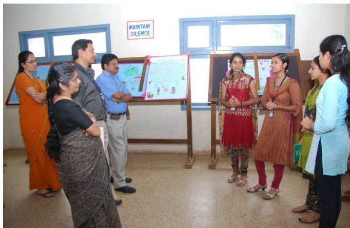
Students at the workshop on 'Using library resources effectively'