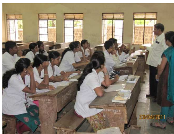
Geology Department staff inaugurating and conducting the Khanija workshop.