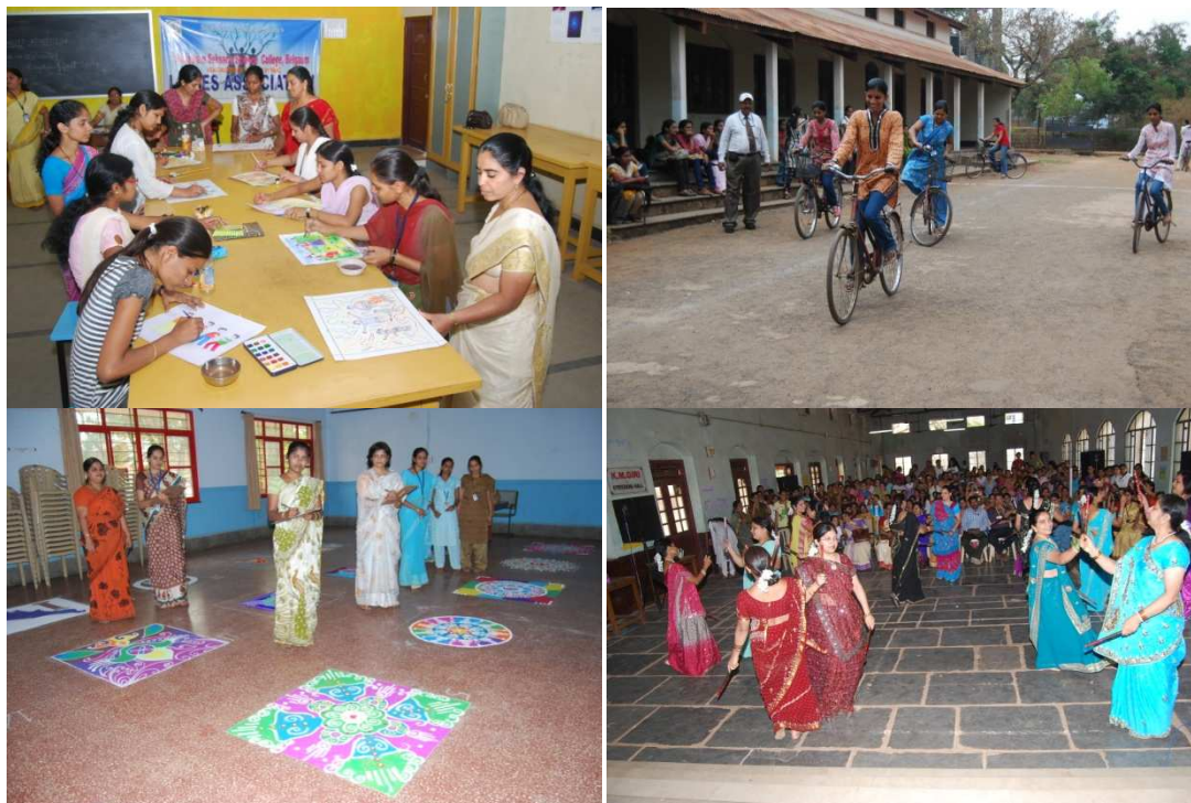
Ladies association activities

M. The college has a Ladies Association, where in ladies staff and girl students are brought together. Ladies week is celebrated with various competitions and programmes.