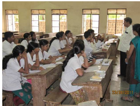
Inauguration of the workshop at BMK Ayurveda Mahavidyalaya; and the practical session workshop with resource persons.