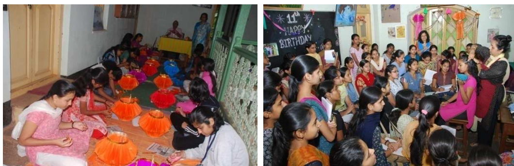
Students learning to make diwali lamps; and self grooming techniques at the workshop