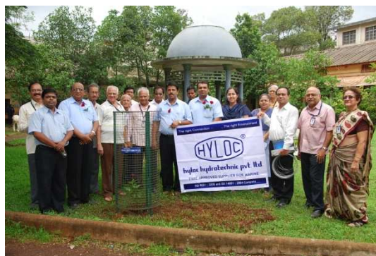
Library workshop was sponsored by Alumni association; Some of the Alumni and industries provided tree guards for the trees in the campus.