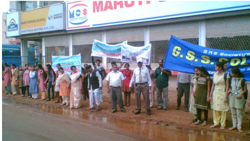
College staff and students participating in the Human Chain.