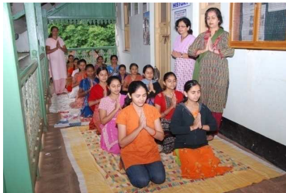
Hobby Centre: Making Diwali lamps and performing yoga