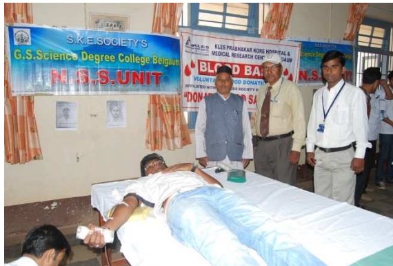
Vanamohtsav at college campus and Blood donation by NSS unit.