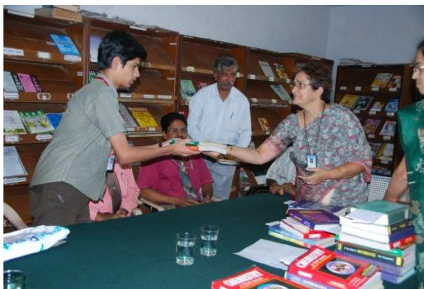
Donated books to bright students