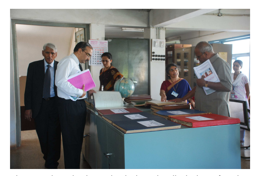
NAAC Peer Committee, evaluating the library during the Reaccreditation process.

The IQAC held extensive discussions and worked out the below-detailed plan of action to promote, enhance and monitor the quality of the teaching-learning process and the pursuit of excellence. The planned measures are under three heads: