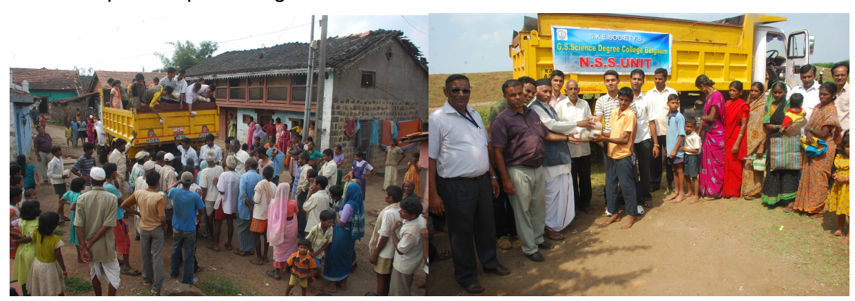
Flood relief distribution to villagers of Kamatnoor by NSS unit.